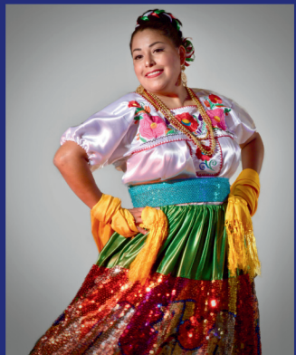
Ballet Folklórico de Barajas